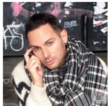
Leny Navarro NY Celebrity Examiner

© 2006-2015 AXS Digital Group LLC d/b/a Examiner.com